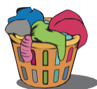
IHSP-NU 2 U Clothing Closet